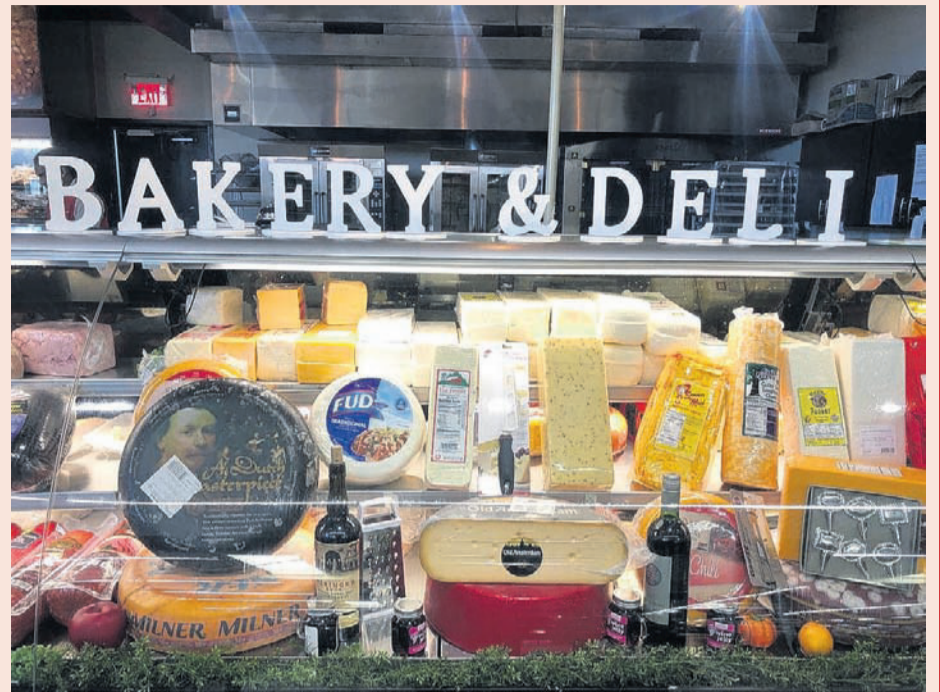
Store as successful as it is today.

Fast forward to today. A Do it Center in Aruba, with more than 50.000 top of the line items for interior as well exterior use, building materials, STO products and a top of the line grocery store. Perseverance, responsibility, vision and the courage to invest have made Ponson's General